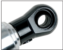
Spherical bearing rod end is available