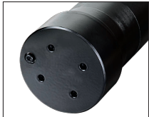
Air bleeding for easily installation